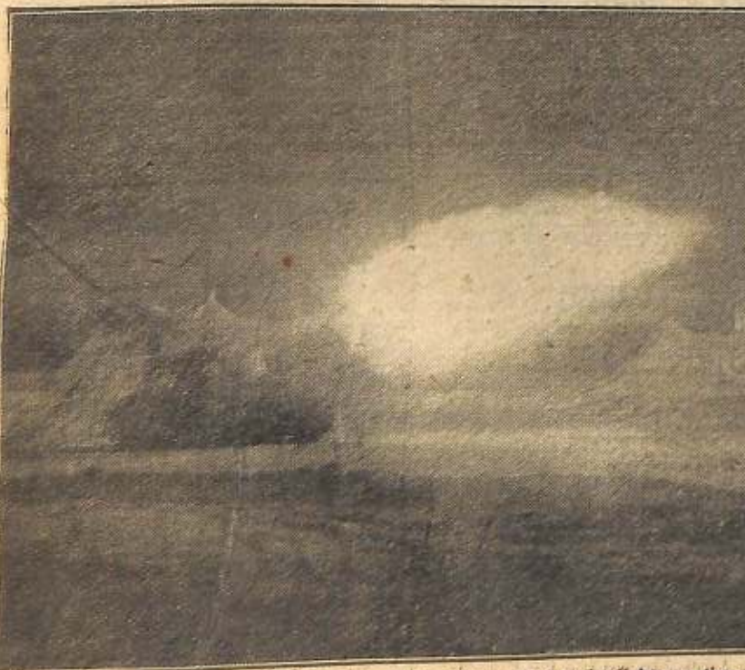
In the blackness of night combat the muzzle flare from M-4 tanks lights up the sky as they fire from Luxembourg into Germany in support of divisional artillery.