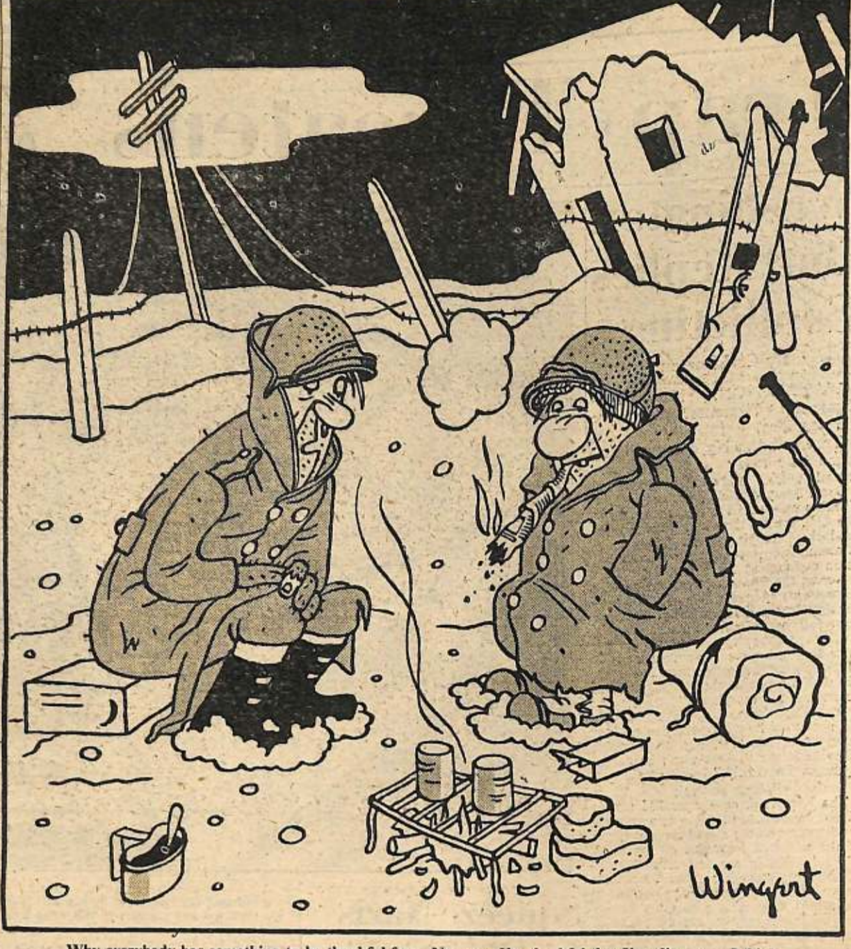
Why everybody has something to be thankful for. Now me, I'm thankful that I'm alive . . . I think.