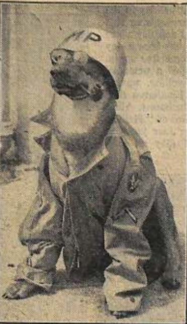
He won't wear the uniform but it's indicative of the work he'll do. Both RAF and US MPs are training dogs as guards for airfields in the U.K.