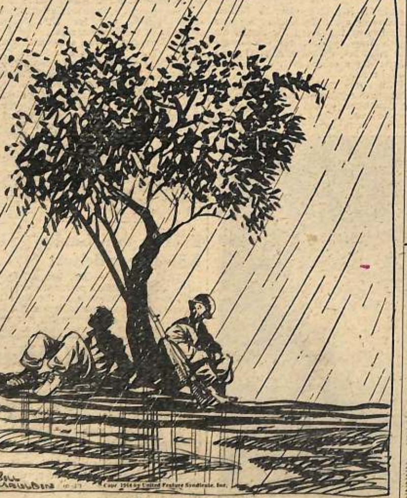
"This damn tree leaks."