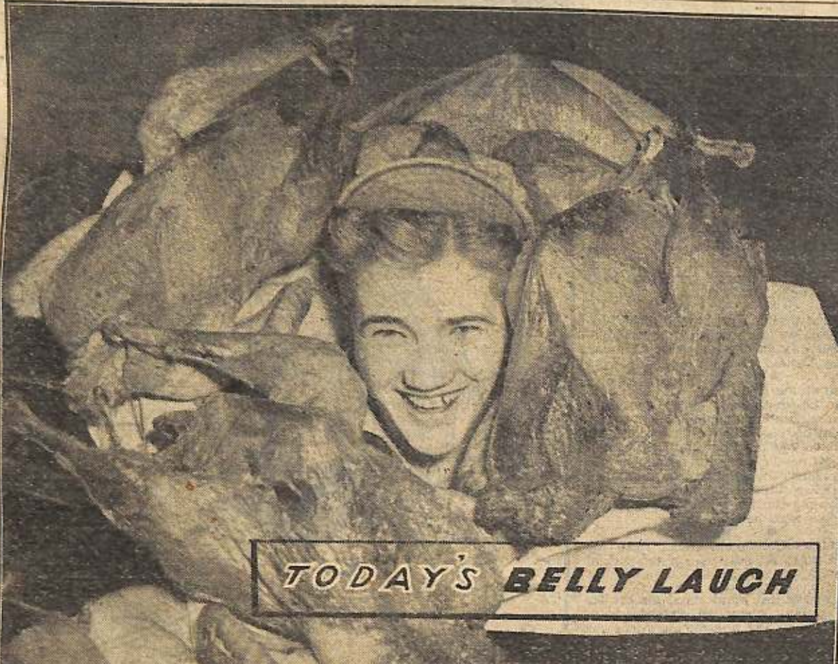
TODAY'S BELLY LAUGH

Meanwhile, cigar stores throughout the country were displaying "No Cigarettes Today" signs in an effort to help in giving the troops an extra smoke. Civilians appeared willing to bear the shortage when they thought it was caused by the extra demand for smokes by the men in the services, particularly those at the front, but neither civilians nor soldiers had them.