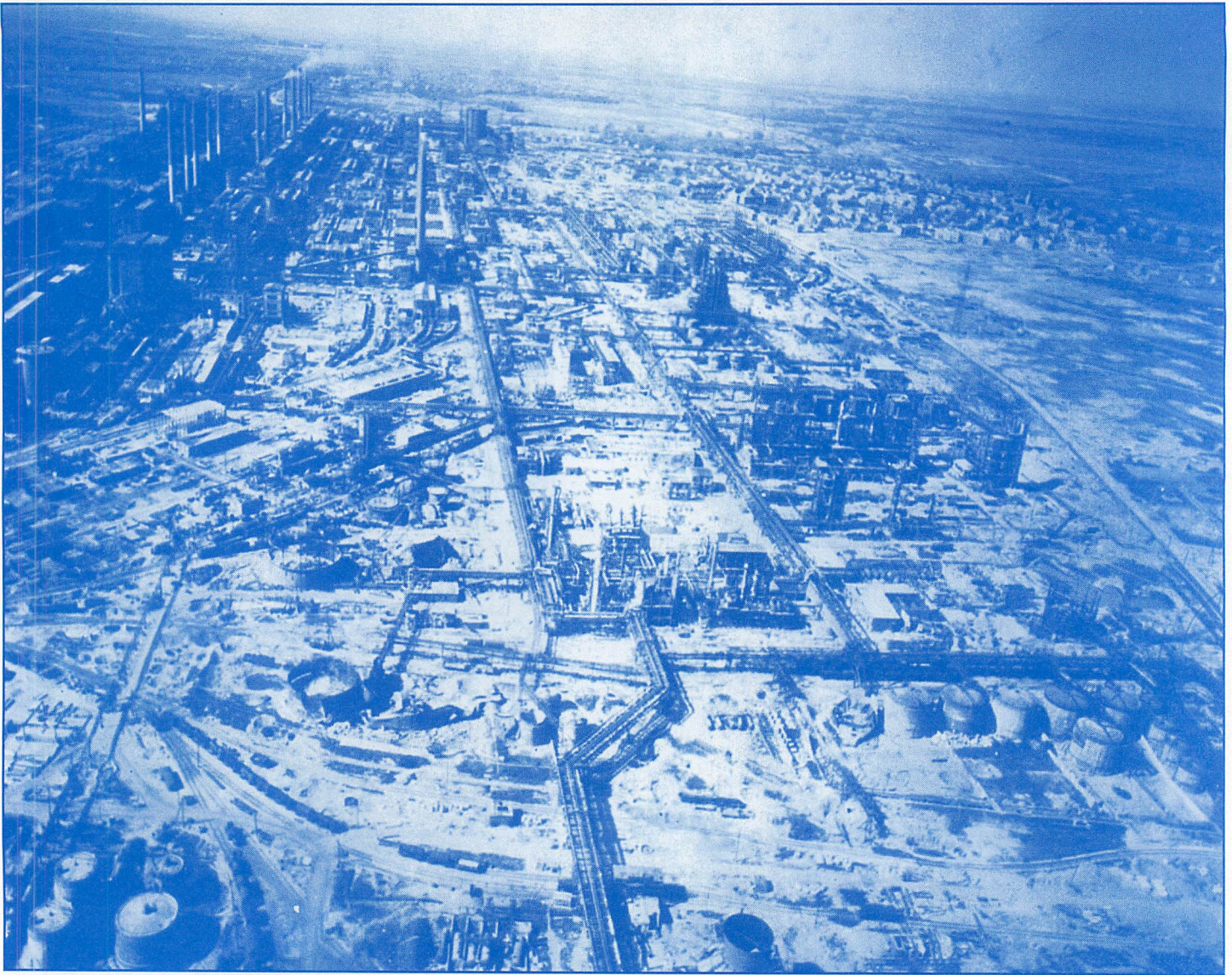
The bomb damage at Leuna Synthetic Oil Refinery at Merseburg, Germany May 12, 1945.