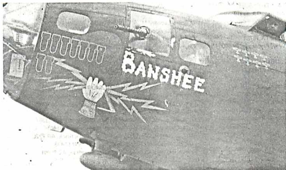
BANSHEE 41-24488, 369th, down 17 April 43, Bremen

Below are a few of many plane pictures which Russ Strong has collected. Unfortunately, we cannot always match plane numbers with names, etc. What data can you supply on these? Or any other planes?