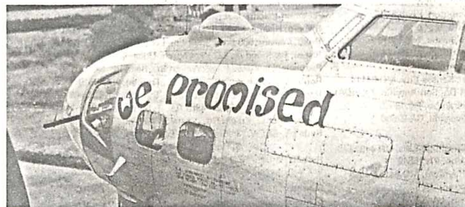
WE PROMISED 42-102578, 367th