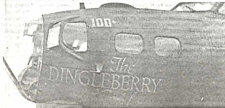
THE DINGLEBERRY KID