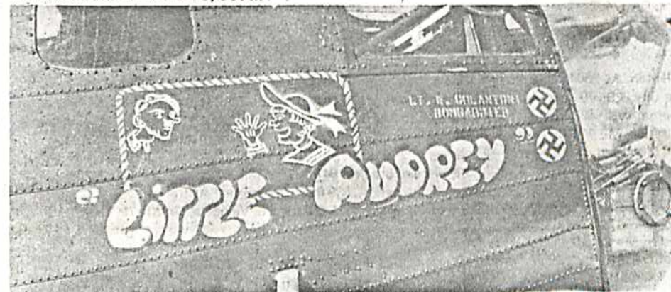
LITTLE AUDREY 42-29477, 369th