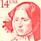
Julia Ward Howe