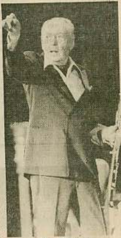
Woody Herman Still leading the Thundering Herd

Until embouchure problems caused by advancing age reduced his sonority to a shriek, he was a decent clarinetist and a better-than-decent alto and soprano saxophonist in a passion-flower style reminiscent of Johnny Hodges — but he was never a star soloist such as Benny Goodman or Artie Shaw.